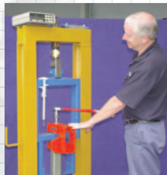
Measuring downward force on bolt assembly.

The SURE GRIP range of belt clamps are of a unique design. Their main feature being the ability to clamp any belt width positively.